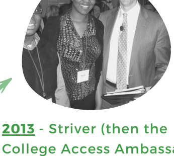
2013 - Striver (then the College Access Ambassador Training program) sends its first graduates to top